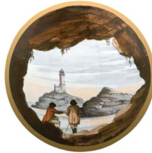
Image: Cambrian Pottery, Swansea, jug painted with a view of the Mumbles Lighthouse, about 1805 (detail), © National Museum Wales.

National Waterfront Museum Garden, Oystermouth Road